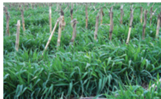
Cereal rye at boot stage - terminate prior to this stage