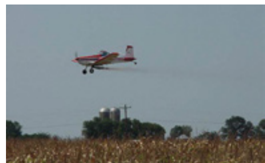
Aerial seeding in standing corn