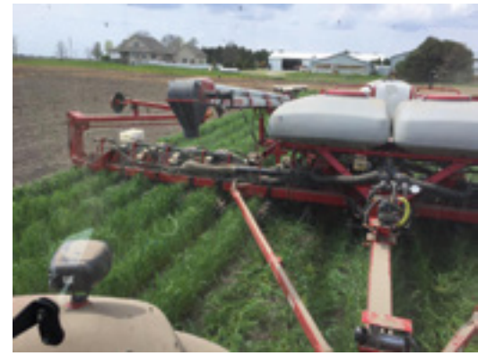
Avoid planting into a green bridge (above).