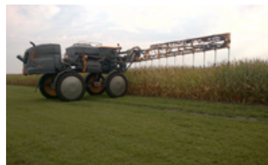
High clearance seeding