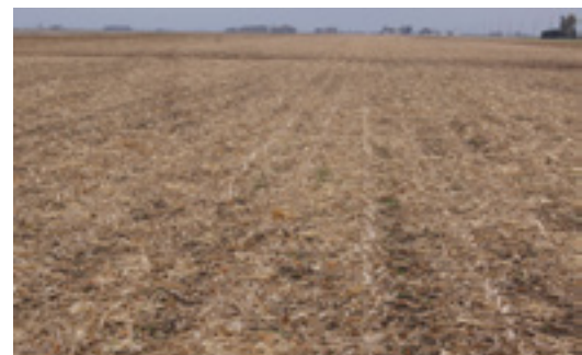
Even corn residue distribution

Surface Application- If you uniformly fertilize the field (no variable rates), cereal rye can be blended with dry fertilizer. A light vertical tillage pass may need to be considered, as surface residue can interfere with seed-to-soil contact.